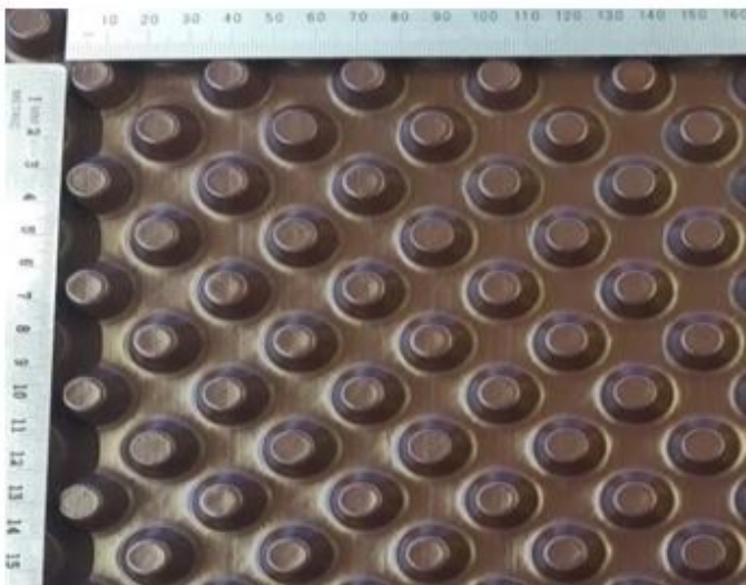
Figure 2. Delta®-MS drainage membrane – face in contact with the wall

This PDF is an alternative version. This document was published on 2022-11-25 and may not be the latest version of this evaluation. Users should consult the latest published assessment on the CCMC Registry of Product Assessments , which contains the most up to date information. This PDF is intended for use as a record, not the latest information available.