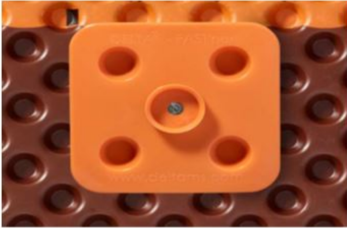
Figure 3. Delta®-MS drainage membrane – anchor