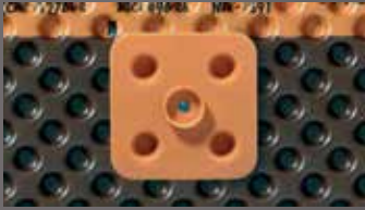
DELTA®-FAST'ner multistud fastener for secure attachment of DELTA®-MS.

Dörken makes your life easier – systematically.