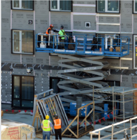
The team installing DELTA®-MULTI BAND 100, a versatile tape with very strong adhesion