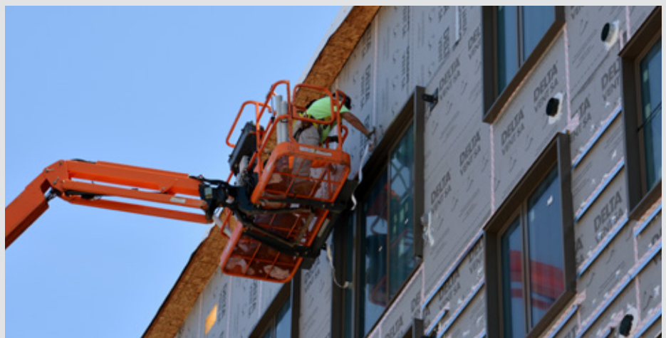
DELTA®-VENT SA is a vapor permeable air- and water-resistive barrier that prevents moisture from getting into buildings

The exterior of Clippership Wharf incorporated a prefabricated wood frame construction with fire-rated OSB sheathing. This approach, coupled with the city's climate zone and unique location challenges, called for the use of a vapor permeable air- and water-resistive barrier. No matter how moisture entered the system, through construction or intense wind-driven rain and snow, the team needed to be confident that any incidental moisture could escape and not cause serious damage to the building enclosure. For these reasons, the team selected DELTA®-VENT SA and DELTA®-FASSADE S PLUS barriers to protect Clippership Wharf.