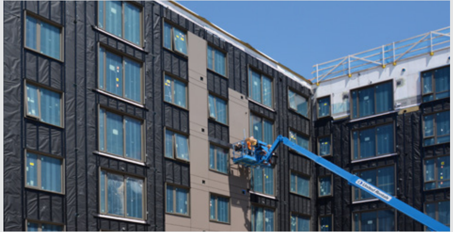
DELTA®-FASSADE S PLUS is highly vapor permeable, and also extremely durable and tear resistant