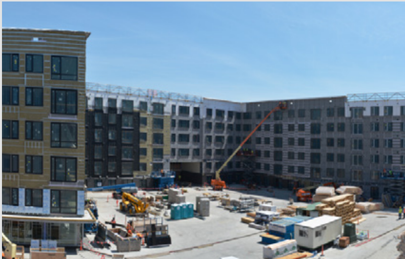
Clippership Wharf is built on one of East Boston's most historic wharfs