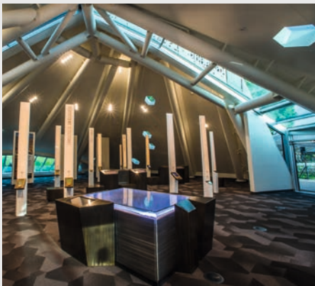
Visitors experience interactive displays

The 5,258-square-foot structure has 16 sides consisting of hexagonal panels in a honeycomb design, with painted steel and angular windows. The exterior is covered in a dark gray cement composite panel material by Swisspearl®, often used as siding but here used as a roof material for the first time. Below the rainscreen, the roof features five inches of insulation, taking its cue from cold roofing projects seen in the mountains.