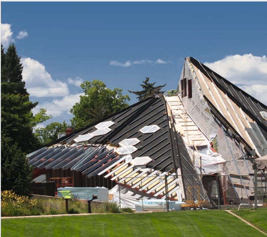
Installation of girts for open joint cladding over DELTA®-FASSADE S