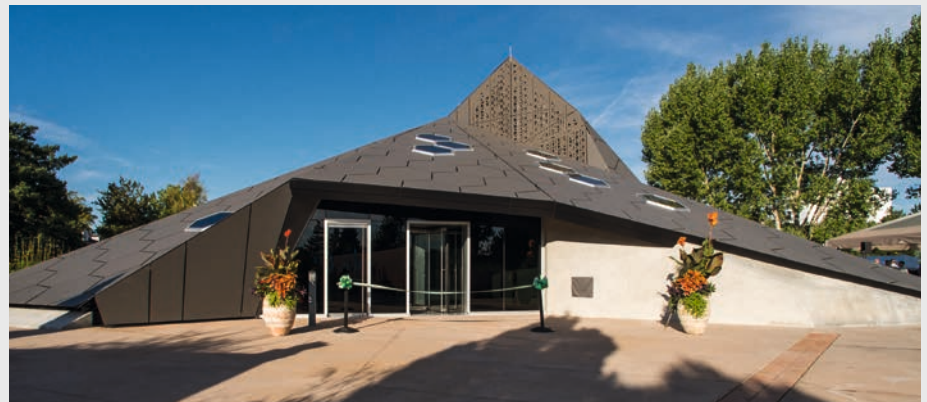
Unique approach to main entrance