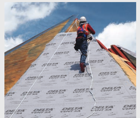
DELTA®-VENT SA adhered to plywood