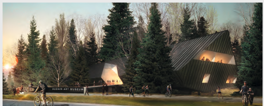
The Audain Museum appears to float in the forest, minimising environmental impact and benefitting visitors.

The air tightness provided by a fully adhered membrane also helps lower energy costs. The adhesion