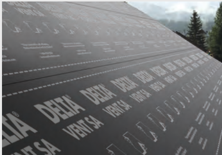
DELTA®-VENT SA provides air tight protection high in the Rockies.