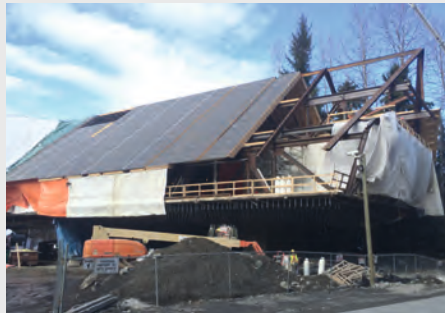
Factory installation of DELTA®-VENT SA speeds the roof construction process.