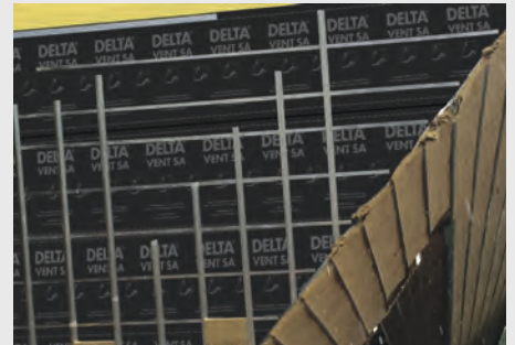
When protecting valuable art, keeping water out is critical.

capability of the membrane helped speed up the building process by allowing builders to construct the roof panels ahead of time in a modular format, in a factory setting. This meant the membrane could be installed in a controlled environment rather than an unpredictable one, and the panels could be transported to the site without the membrane blowing off.