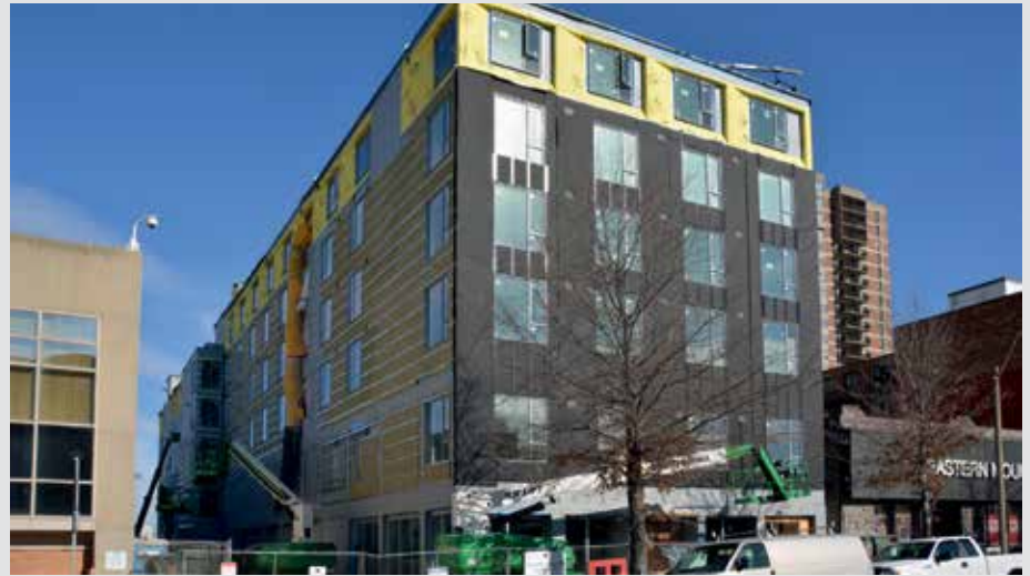
DELTA®-FASSADE S is designed specifically for the demands of open-joint cladding