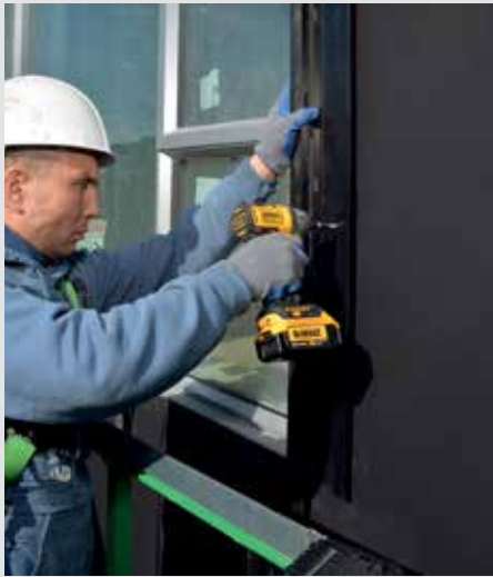
DELTA®-FASSADE S is highly vapor permeable and extremely tear resistant